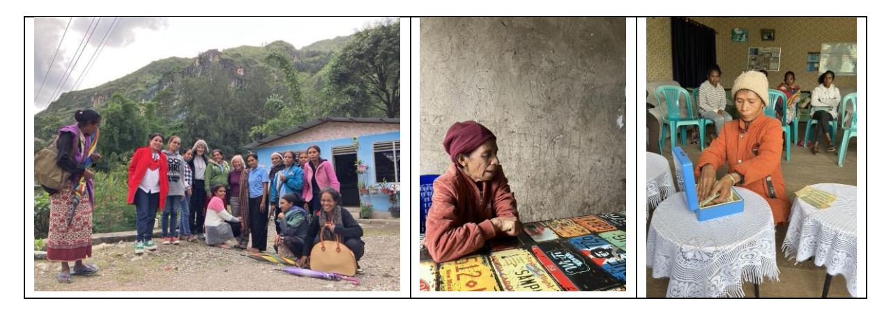
In July 2022, the Hatobuilico Women's Centre was also formally opened. The ceremony was attended by local officials demonstrating the connectedness and visibility of the groups.

Some of the groups are going very strongly with powerful and clear leadership; some groups have more limited skills and leadership; there is some conflict within some of the groups but in most instances the members get on amazingly well and cooperation is exemplary.