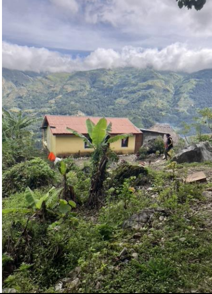
Opening of the Hatobuilico Women's Centre / Restaurant