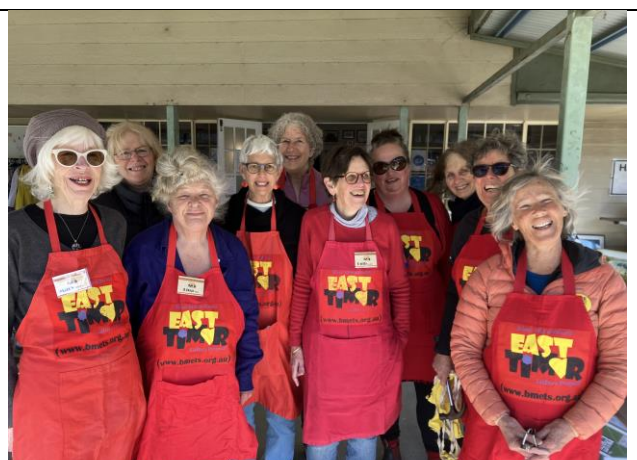
BMETS Garage Sale The glue that binds us together